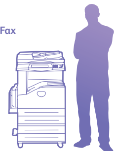
WorkCentre 5222 with two-tray module

25.2 x 25.7 x 43.8 in. 640 x 652 x 1,113 mm