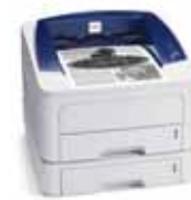
Phaser 3250 shown with optional Tray 2